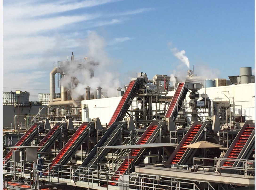
Flumes conveying tomatoes at Pacific Coast Producers in Woodland.